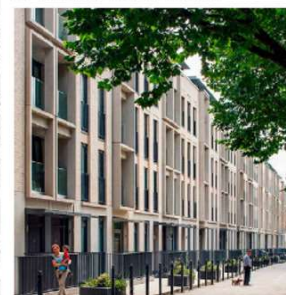
PHASE I BY PRP ARCHITECTS