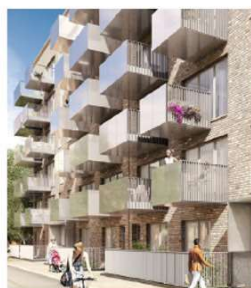
PHASE II BY CONRAN AND PARTNERS

PHASE I: TRADITIONAL LANGUAGE PHASE II: TRANSITION PHASE PHASE III: MORE CONTEMPORARY PHASE