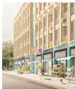
PHASE II BY CONRAN AND PARTNERS