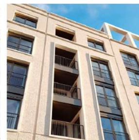
PHASE II, BLOCK 4 BY CONRAN AND PARTNERS